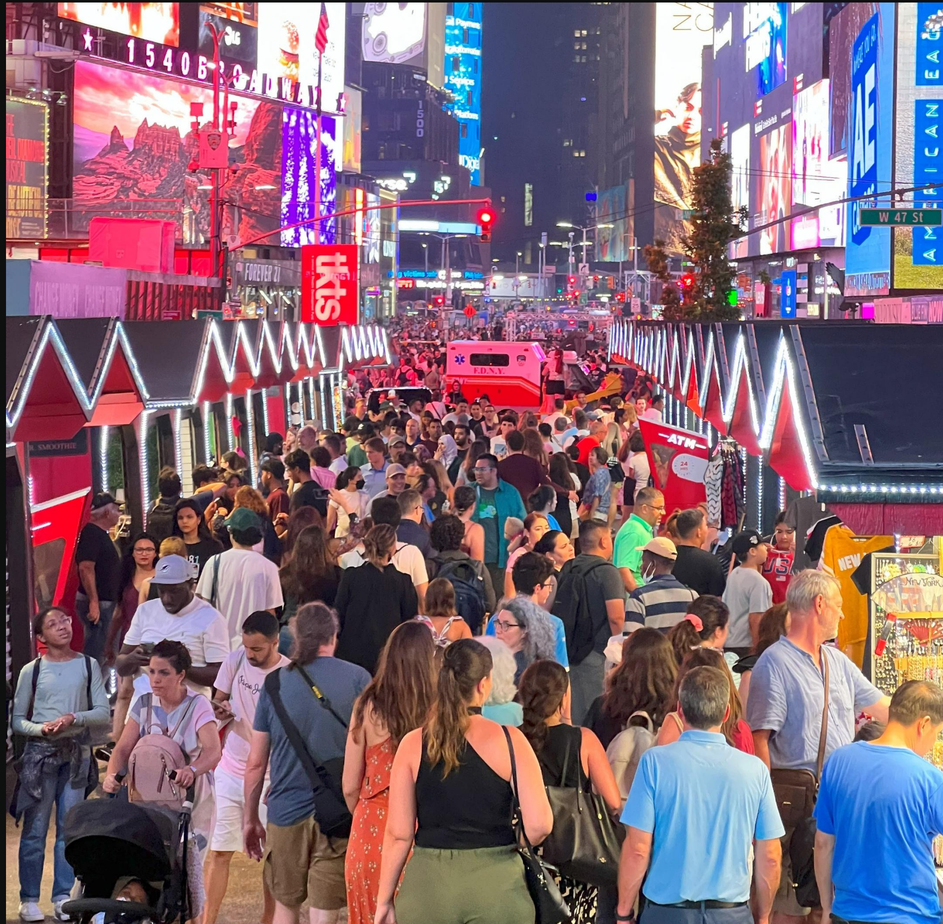
On Broadway between 47 th & 48 th Street