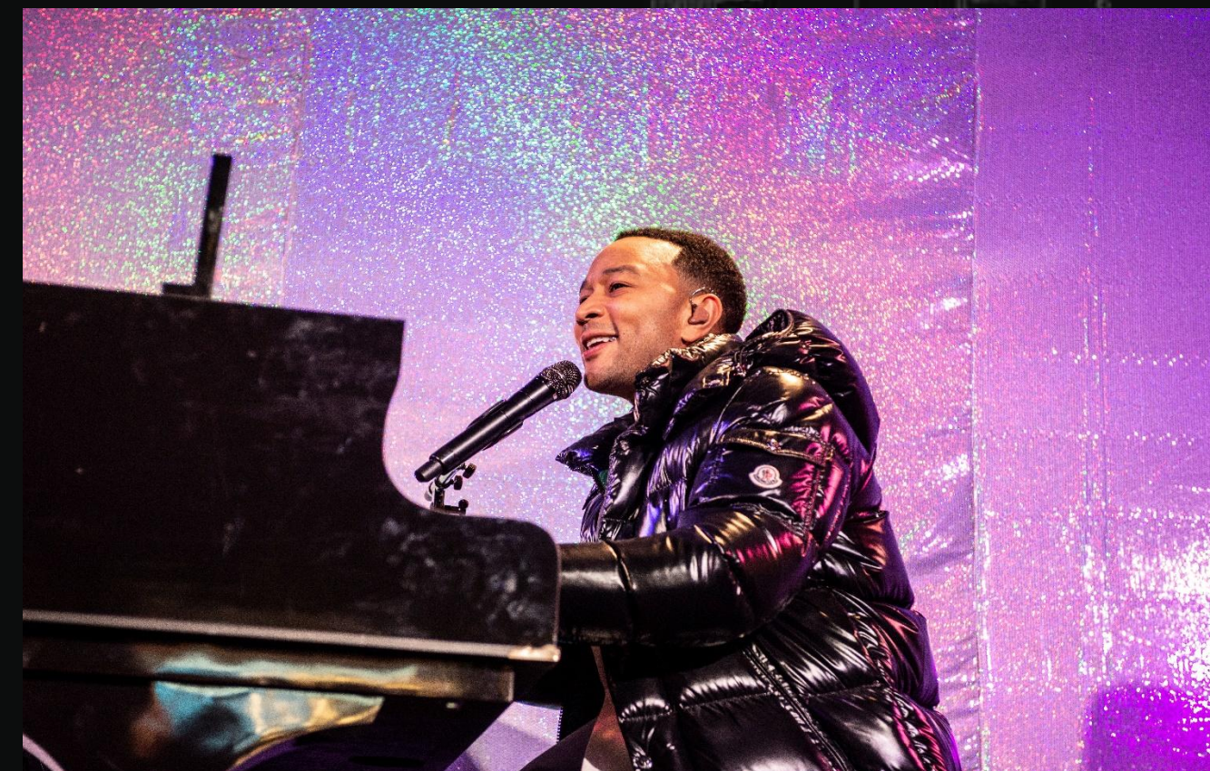
John Legend Performs at Bloomingdale's Holiday Windows Unveiling 2019