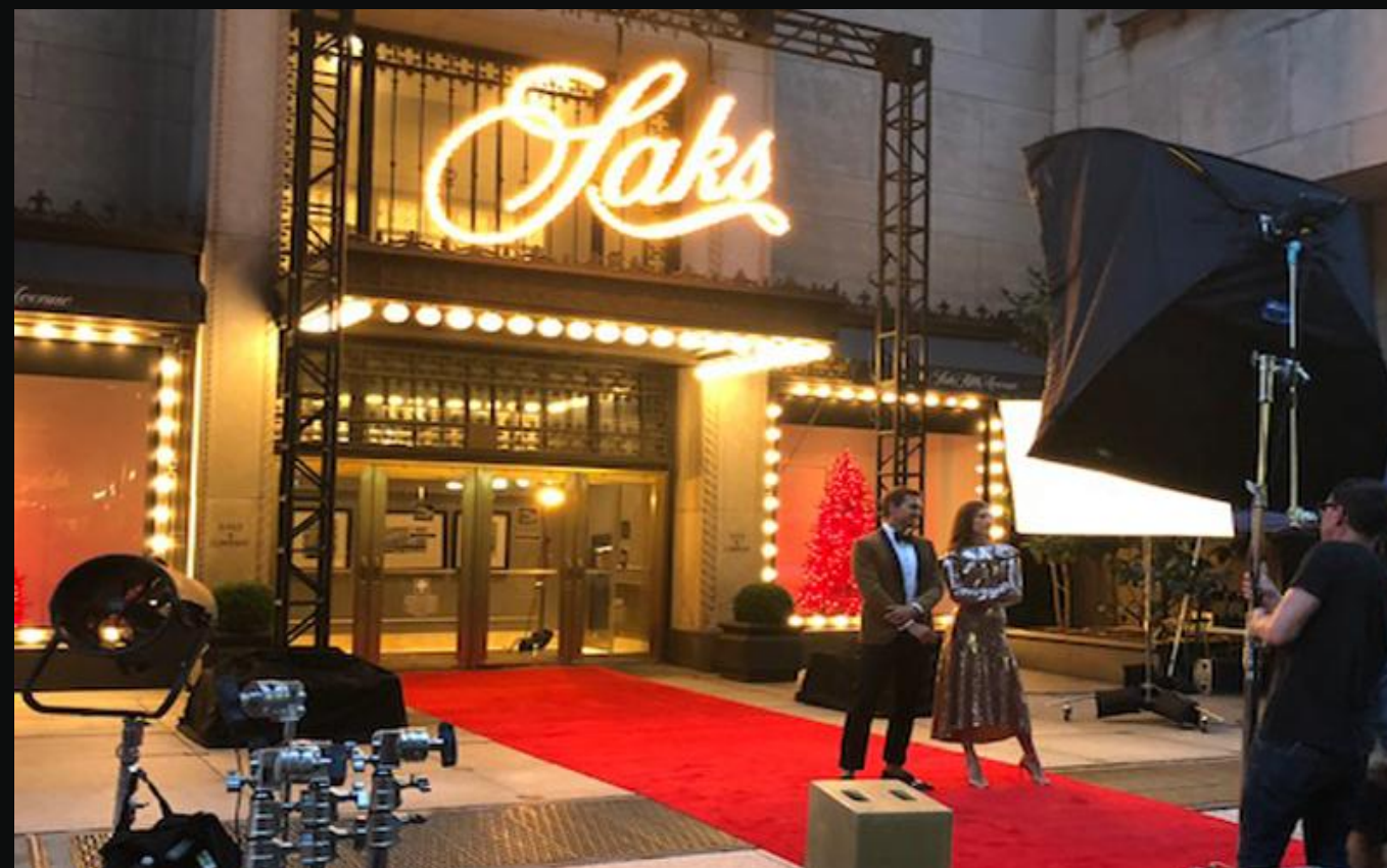
Saks 5 th Avenue Magazine Shoot

These events are attended by millions of international tourists and New Yorkers alike .