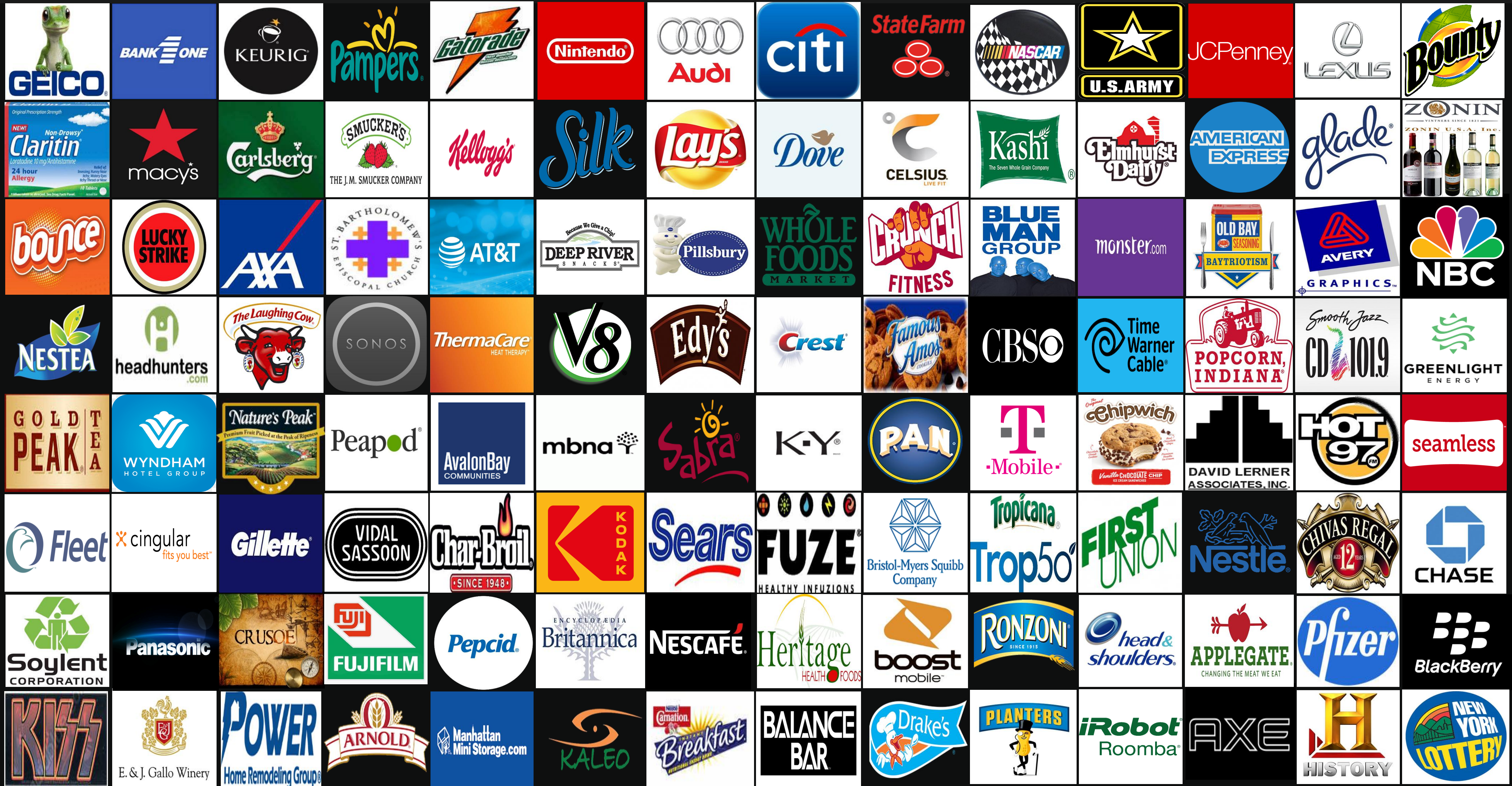
Past and Present Corporate Clients