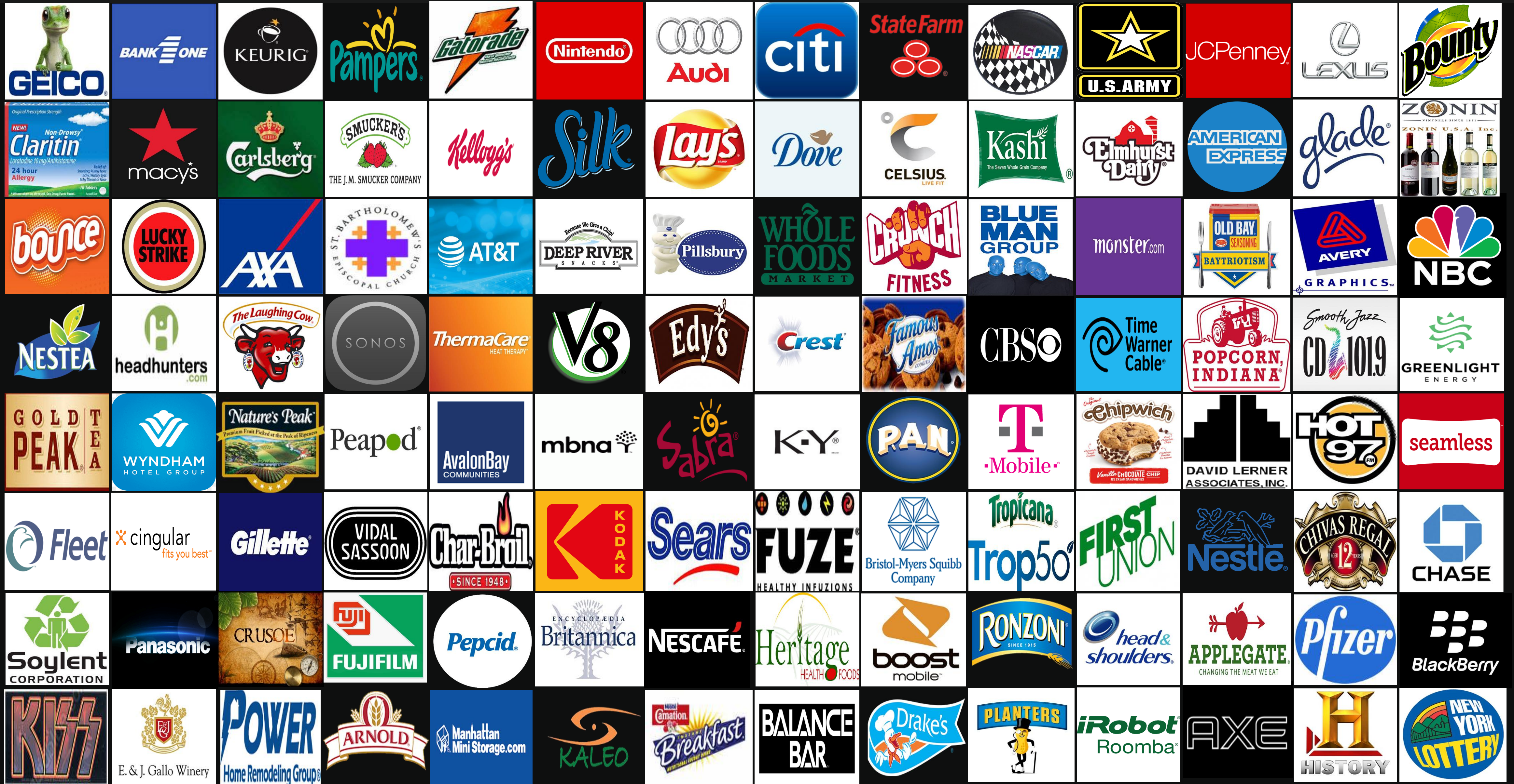
Past and Present Corporate Clients