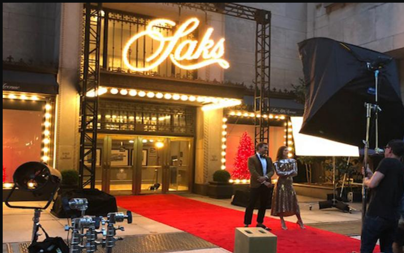
Saks 5 th Avenue Magazine Shoot

These events are attended by millions of international tourists and New Yorkers alike .