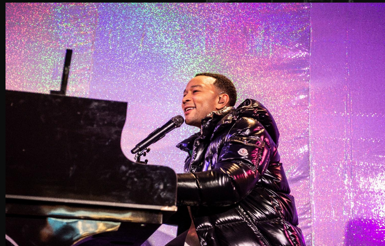
John Legend Performs at Bloomingdale's Holiday Windows Unveiling 2019